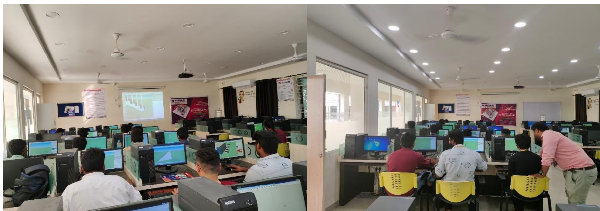
Students are doing practice and trainer clarifying doubts